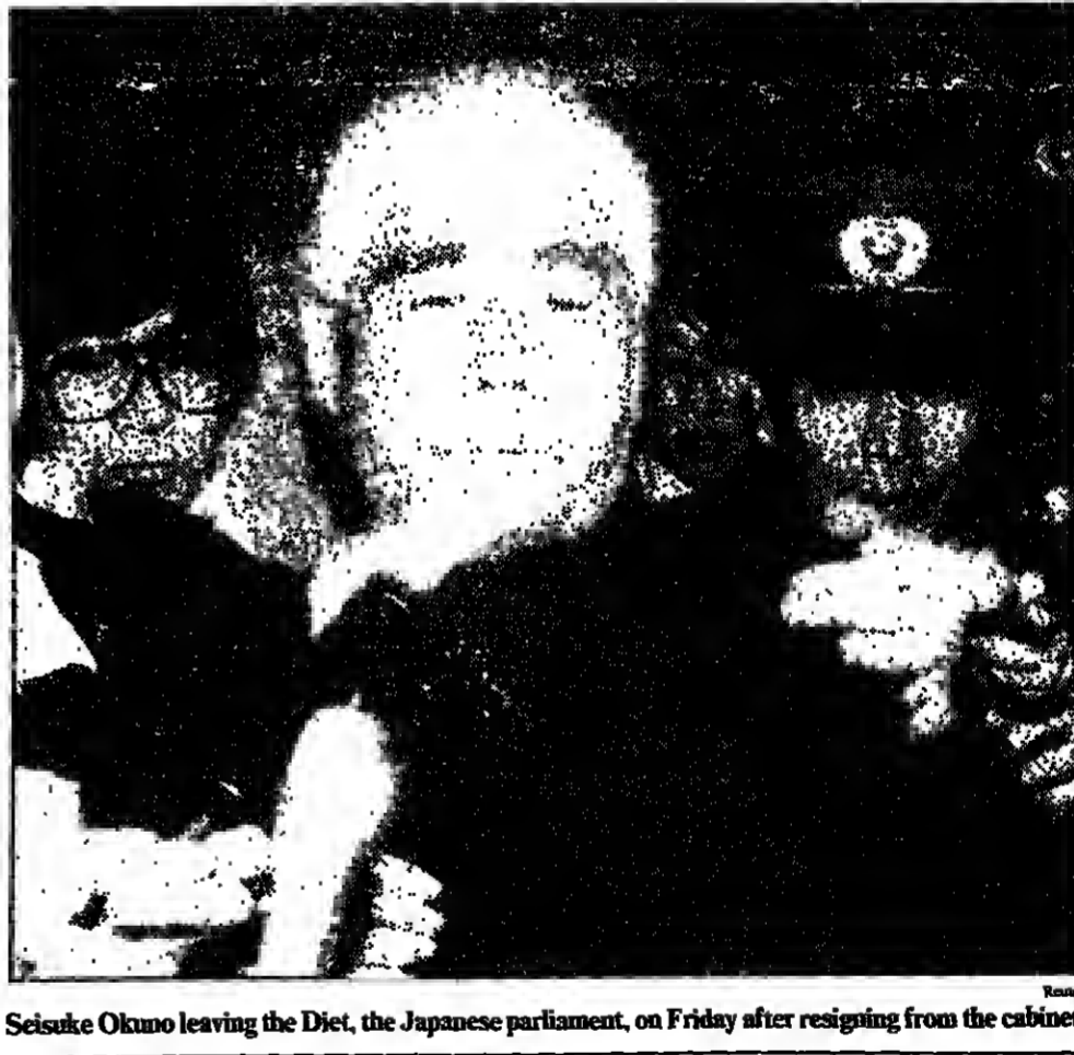
Seisuke Okuno leaving the Diet, the Japanese parliament, on Friday after resigning from the cabinet.

By Patrick L. Smith International Herald Tribune TOKYO — Seisuke Okuno, the cabinet minister whose assessment of Japan's wartime role has acutely embarrassed the Japanese government at home and abroad, resigned Friday amid mounting parliamentary pressure and deepening divisions within the governing Liberal Democratic Party.